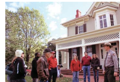
Buckeye alumni enjoyed a tour of the Frederick Douglass National Historic Site in November 2010.

A group of Graduate Students from The Ohio State University's John Glenn School of Public Affairs traveled to Washington, DC the week of March 20th-27th for a career and policy trek. During their visit, the group toured Government agencies, attended Policy Forums, networked with local alumni and visited the monuments and other points of interest. During their stay, they attended an alumni networking reception co-hosted by the DC alumni Club and the John Glenn School Graduate program. The students had an opportunity to talk to local alumni and learn about the DC alumni club while getting an opportunity to network with working professionals and understand the culture and environment of our nation's capitol.