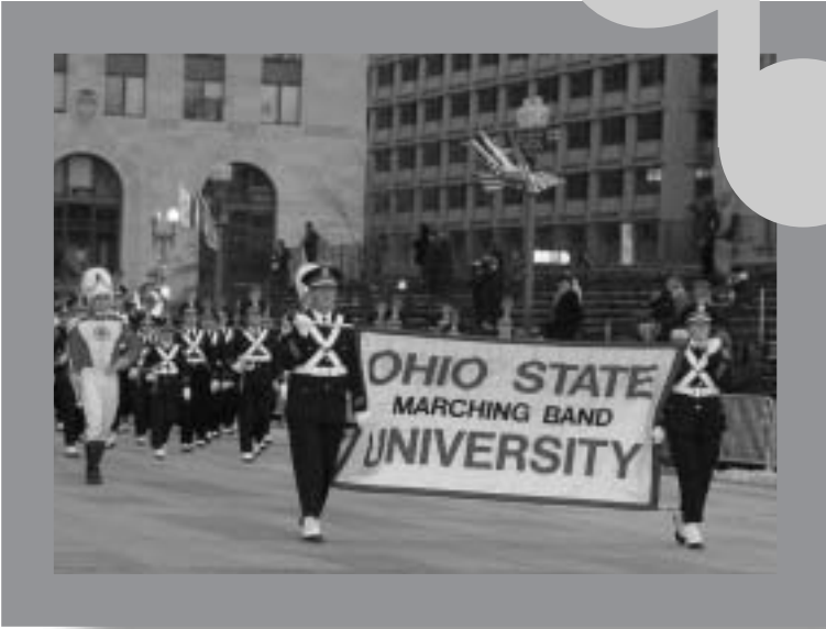
OSU's TBDBITL shows their true Buckeye Spirit in the 2005 Inaugural Parade in Washington DC.