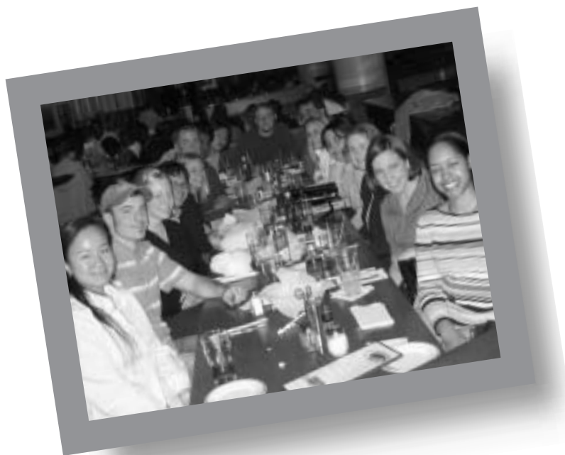
Ohio State students met local alums for dinner while spending their "alternative" spring break working in DC.