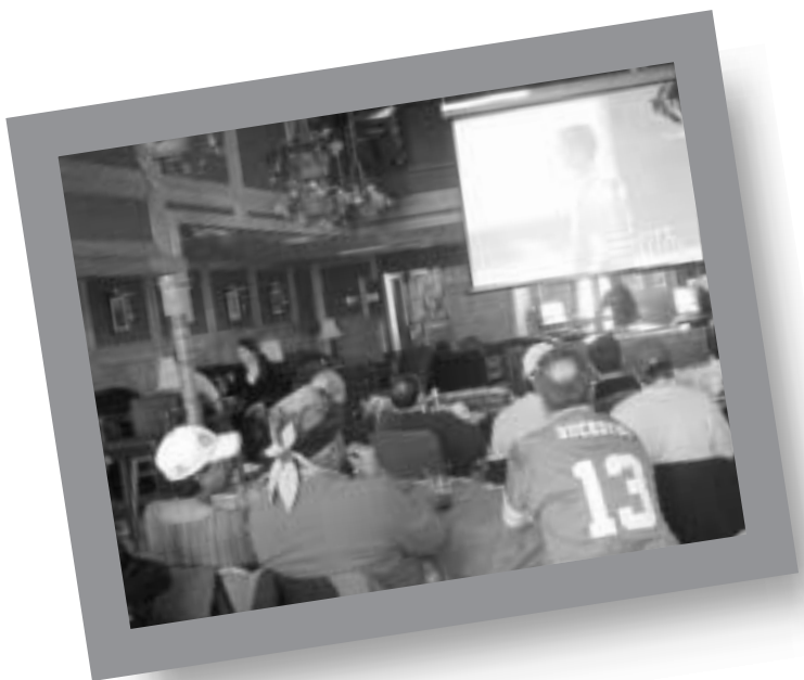
Ohio State fans cheer on our men's basketball team at the recent Ohio State v. Michigan gamewatch at the Pour House in Washington.

Ohio State alumni met up with alumni from "that school up North" to watch the Ohio State v. Michigan basketball game on February 29. Though the Bucks came out on the losing end, it was a good game and was enjoyed by Buckeyes and Wolverines alike.