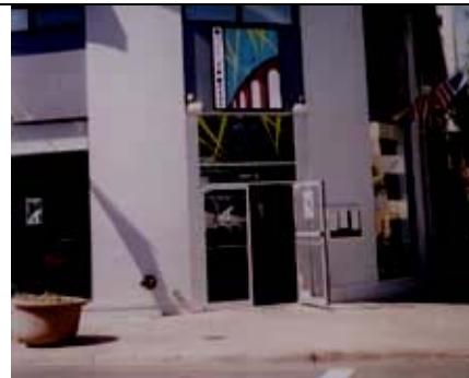
Willie & Reed's Sports Bar

Whether you are new to our club or to the area, or an old timer, please come and join us for some "Buckeye" fun,